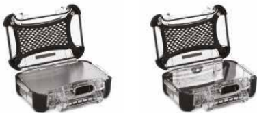
Aluminum panel kit