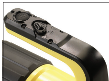
Multi-function push-button switch; secondary rotary mode-selector switch