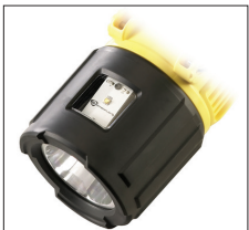
Flood light produces a soft, wide beam to illuminate your work area