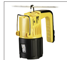
Spring-loaded D-ring stows against the body of the lantern when not in use