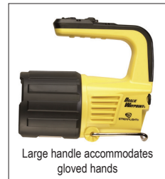
Large handle accommodates gloved hands