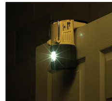
Hang over doors, pipes, ladder rungs, etc., for hands-free lighting