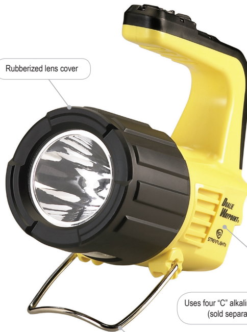
Rubberized lens cover